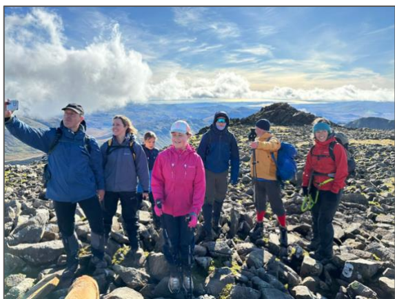
Summit of Scafell – the outtake