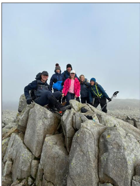
Via Summit of Broad Crag,