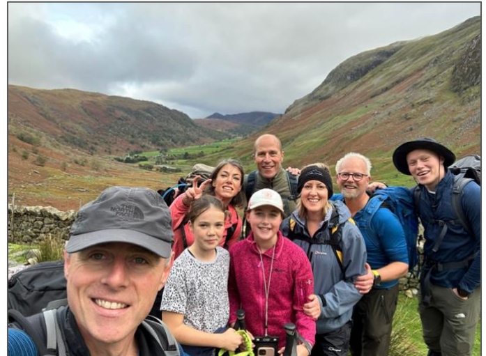
Still smiling, 1 hour in.