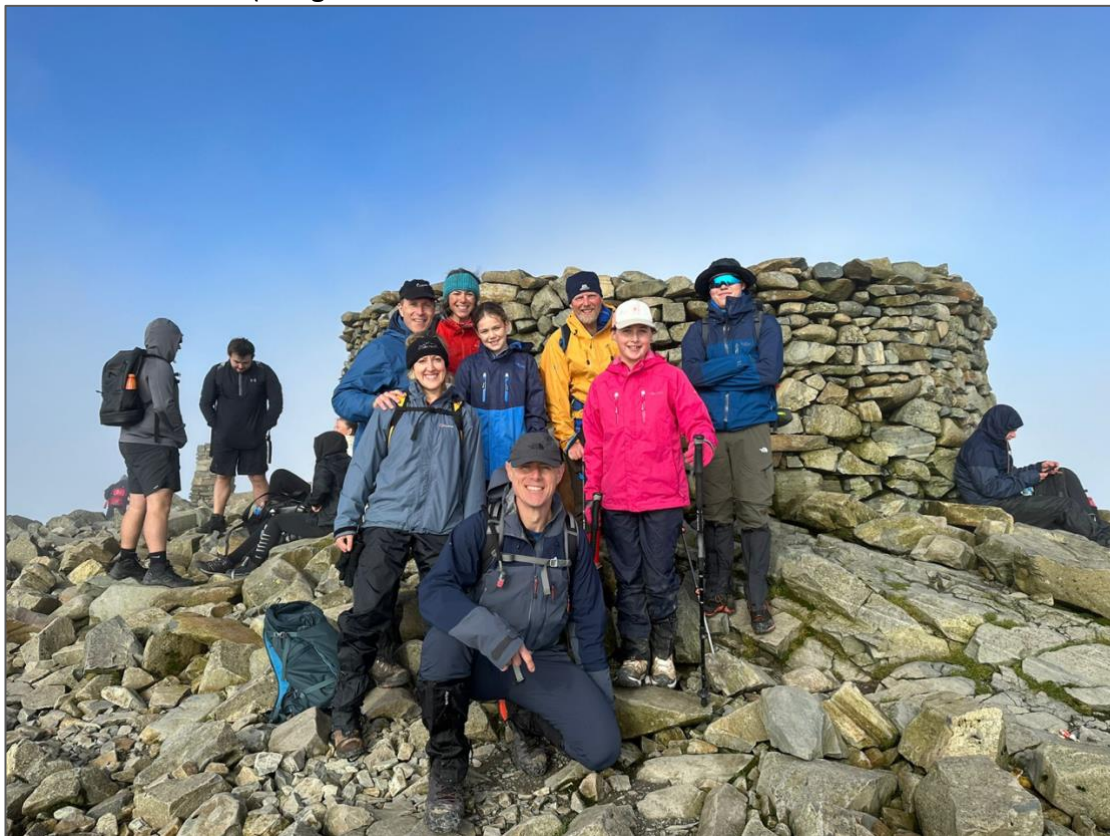
Summit of Scafell – the official shot